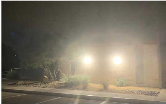
After the lighting upgrade.

Your HOA is working to make the area around the clubhouse safer while also enhancing the security of the area.